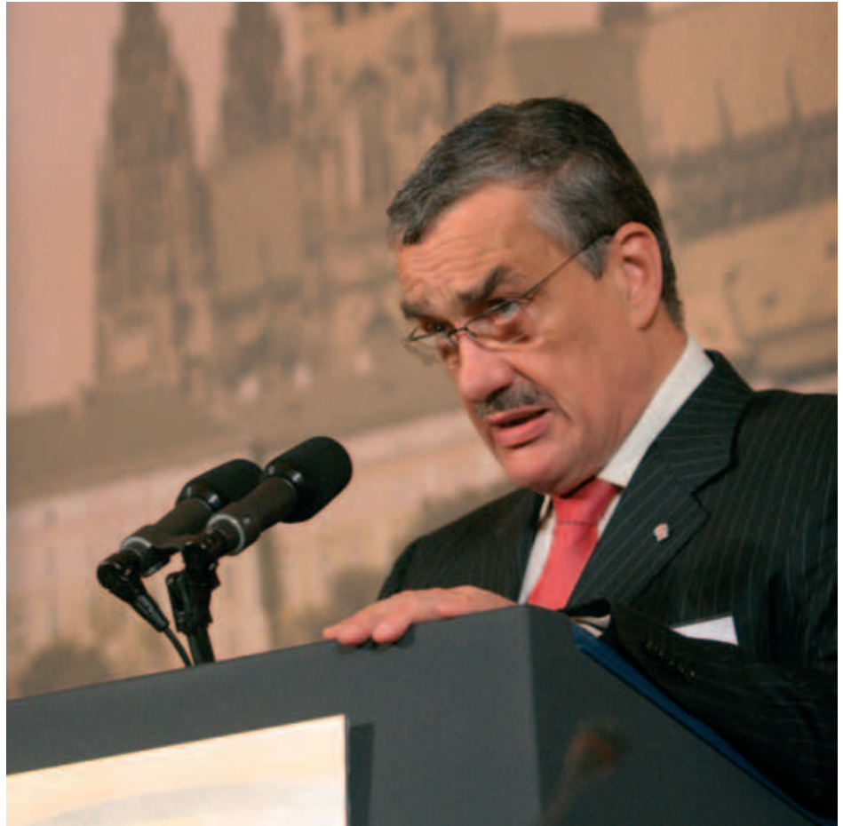
Minister of Foreign Affairs of the Czech Republic Karel Schwarzenberg

“The most dangerous thing for a dissident is to be ignored; only the solidarity of the world makes it possible for dissidents to continue their