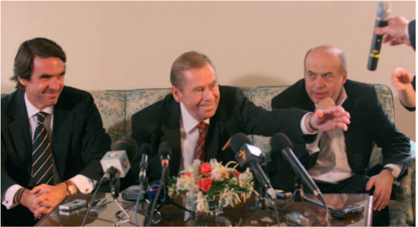
President of the FAES Foundation José María Aznar, Former Czech President Václav Havel and Chairman of the Institute for Strategic Studies at the Shalem Center Natan Sharansky at the press conference