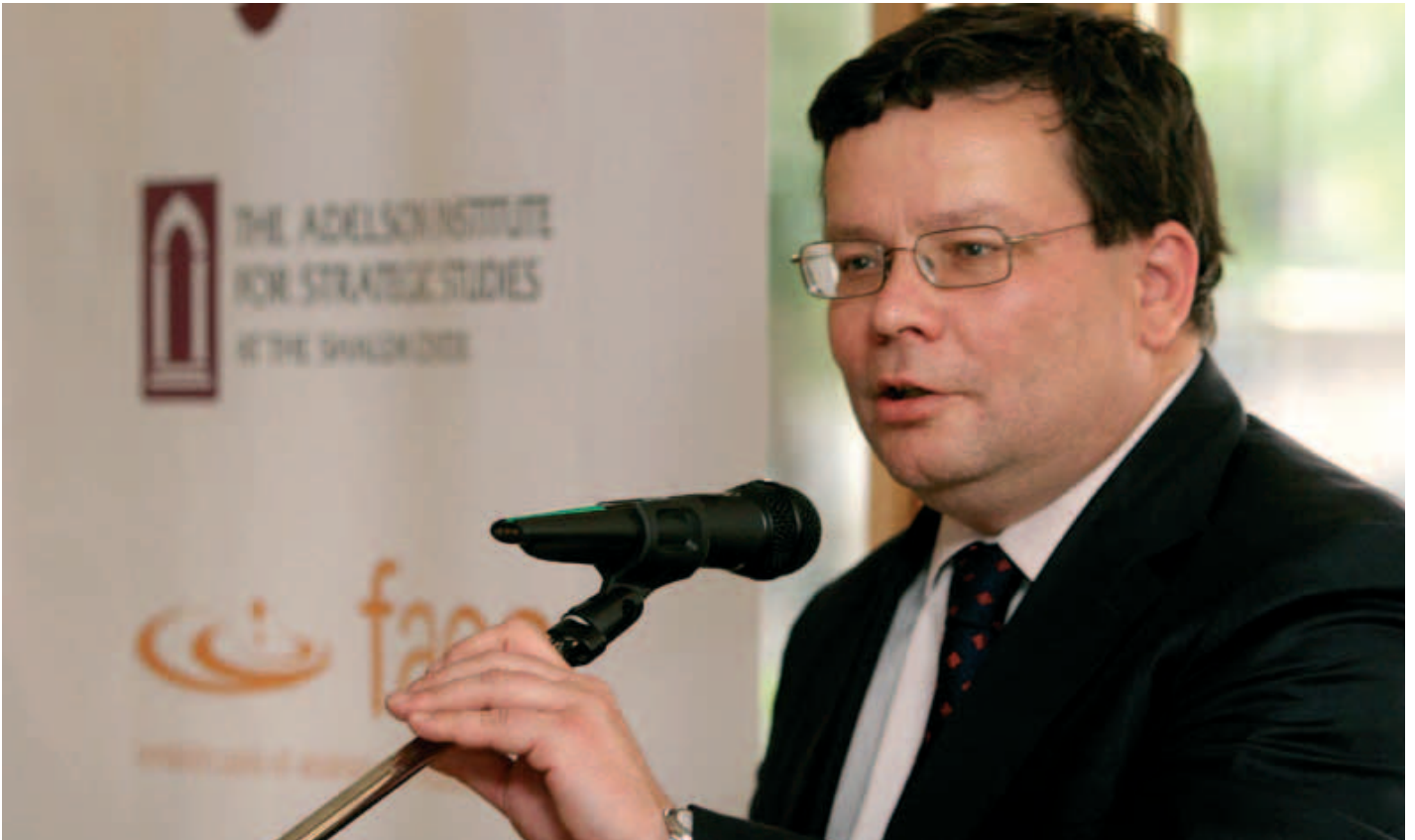
Deputy Prime Minister for European Affairs Alexandr Vondra