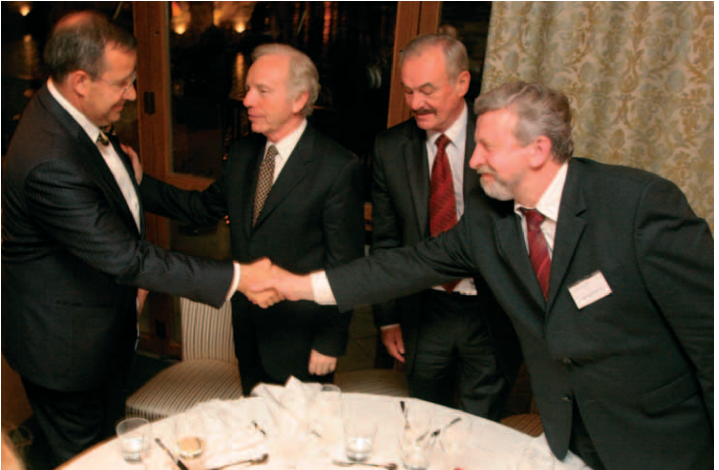
Estonian President Toomas Hendrik Ilves, Senator Joseph Lieberman, Speaker of the Czech Senate Přemysl Sobotka and President of the Political Council of Democratic Forces Aliaksandr Milinkevich