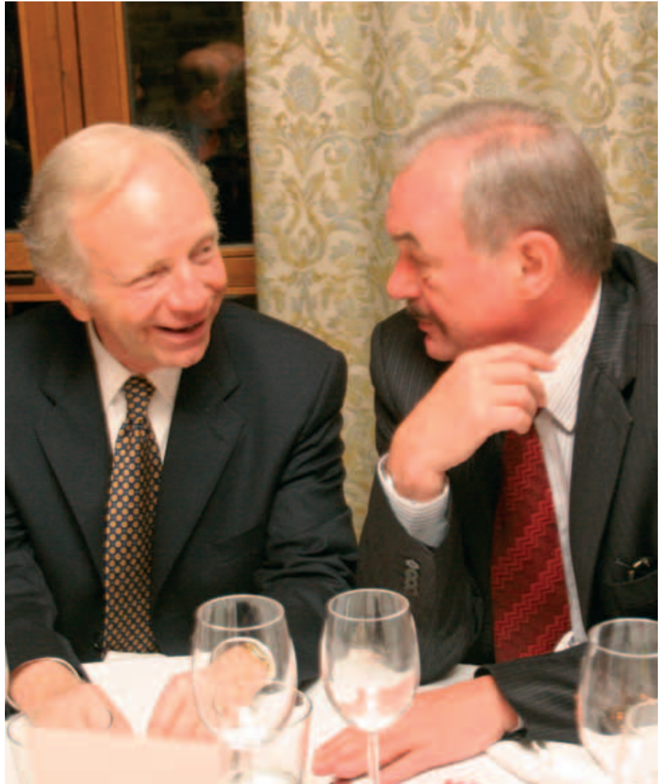
Senator Joseph Lieberman and Speaker of the Czech Senate Přemysl Sobotka

„It is not true that there are some places in the world where only authoritarianism is possible. We have people at this conference from China, from Iran, all these people who are connected by their desire to lead a dignified life. By democracy we can understand the conditions that respect this desire.“ Václav Havel, from the interview with Wall Street Journal, June 2007